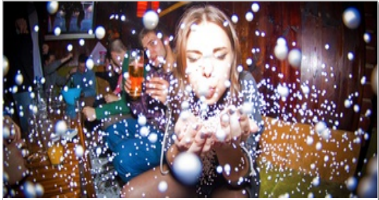
"POLAND IS A COUNTRY THAT'S UNKNOWN TO MOST PEOPLE..."