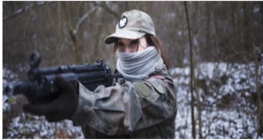
THE STUDENTS IN KRAKOW PREPARING FOR WAR