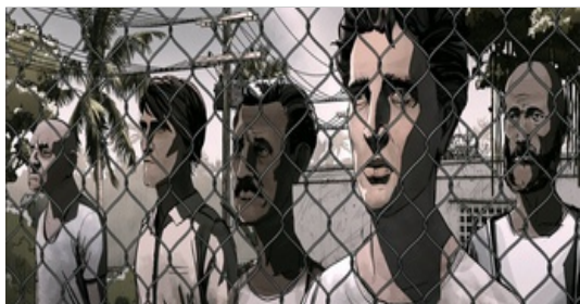
NOWHERE LINE: WHAT FUTURE FOR THE MANUS ISLAND MIGRANTS?