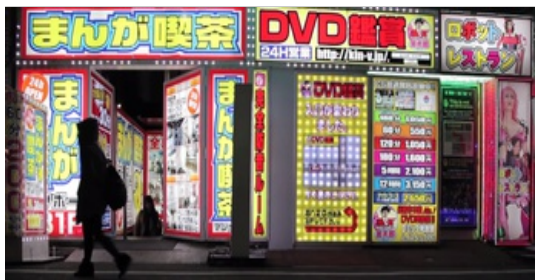
LOST IN MANBOO: MY LIFE IN A CYBER-CAFÉ