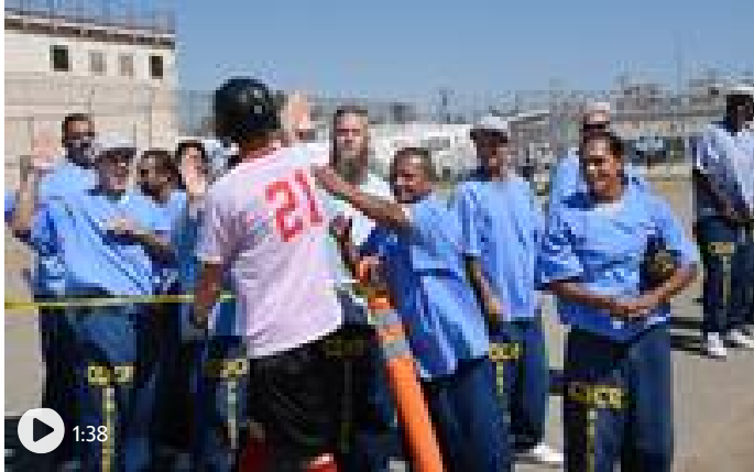
Welcome to prison, no really. Inmates play friendly with Special Olympics athletes