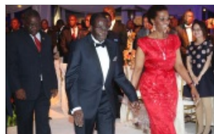
Mugabe Gets U.S.$10 Million, Full Salary and More