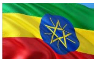
Political Dominoes Topple in Ethiopia