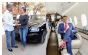
Meet Malawian Billionaire Prophet Who 'Walks On Air'