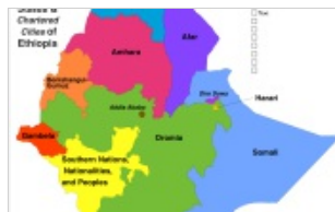
More Fatalities in Western Ethiopia Amid Communal Violence