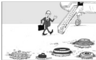
Angry Mugabe in South Africa, Leaves Wife Behind