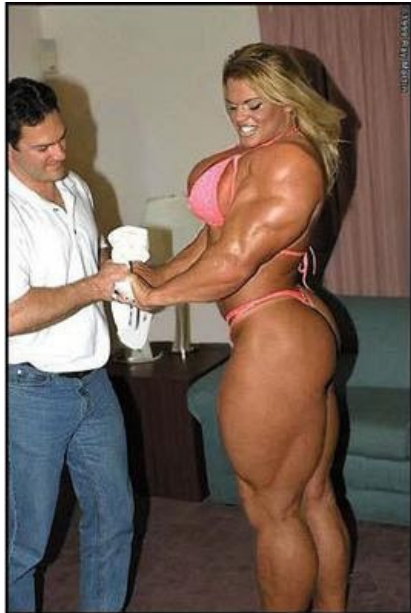
Better than being fat for sure, but it kinda looks a little, well I'll keep it to myself.