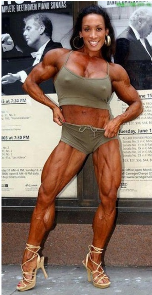
She reminds me of Jennifer Beals in the 80's film Flash Dance! 100% muscle, there's not an ounce of fat on her.

I don't know any of these lady's names. I just think of them all as Ms. Muscles.