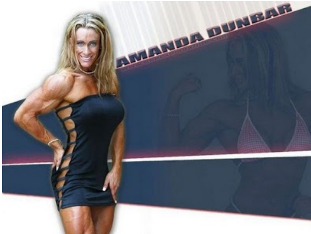
Half man, half woman? Her arms look totally like Arnold's used to. She looks a little like Suzanne Somers to boot.