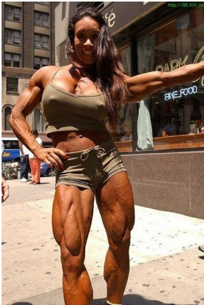
What's with the rock hard nipples? Did she turn them into muscle too?